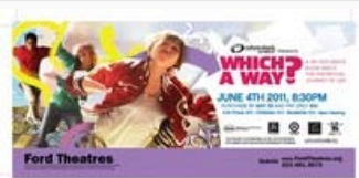
Slideshow: Ford 2011 summer season highlights