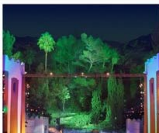
The outdoor Ford Amphitheatre in Hollywood